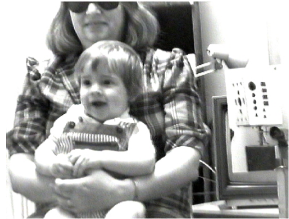
Figure 2. Infants follow the "gaze" (orientation) of a non-humanoid robot that moves contingently. Infants also show positive affect toward the contingent robot.

more rapidly across trials when targets were repetitive and simple than when targets were distinctive and complex. Apparently infants learn over several trials whether an adult is producing valid social cues—that is, whether the parent is looking or pointing at interesting or boring things.