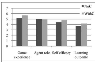
Figure 1 shows that students in the WithC-group tended to have a more positive game experience (diff=0.54, p=0.07), but there was no difference in the perceived role of the TA in the game, and marginal differences in self-efficacy beliefs. Also students in the WithC-group tended to reach better result in terms of how well they taught their TA (diff=0,3, p=0.07).

Since not all students could participate in all three lessons or fill in the questionnaire, the final analysis included 29 females and 32 males. A comparison of the results on the questionnaire and the knowledge level of the trained agent for the NoC- and WithC-groups is presented in Figure 1. Items were clustered and an average score calculated for the game experience, the perceived importance of the agent’s role in the system, and self-efficacy beliefs. The students’ learning outcome was calculated based on the agent’s final knowledge level in relation to how many times the student had played and trained the agent.