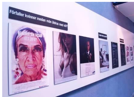
Sample of questions and commercial ads on the walls of Blå Stället – “Do women grow older while men age with dignity?”

printed and applied to boards. The questions included “What roles do toys create?” or “Is society more equal when men care about their beauty?”.