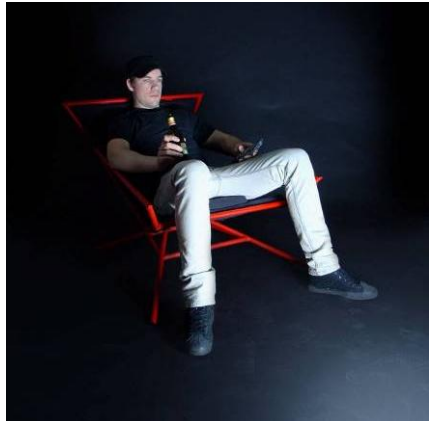
Slashes 2006/Slothfully 2006

commented on the male slacker, which was enhanced by the picture on the drape behind the chair (see below) and as expressed in the title. In the exhibition, a TV set showed a film with car racing to further strengthen the message.