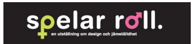
The exhibition title and logo

The exhibition concept was developed around the objects by the students themselves. The exhibition was initially to be limited by a representation of their personal reflections, i.e. with no demand for a more extensive representation of the scope of design and gender. However, once the students had visited the site, which is situated in a building complex which also holds the social office as well as the high school, they were triggered to also attempt to convey a wider discussion on gender and design, not least to engage the pupils of the Angered high school that would pass the exhibition every day through the corridor. Thus, the over-arching theme of gender and design, in their interpretations, held the objects together. This was achieved in several ways. The title chosen was immediately directed towards the high school pupils and expressed the wider scope of the exhibition. After a session when many possible titles were “thrown up”, the choice fell on “Spelar Roll – en utställning om design och jämställdhet” (Spelar Roll – an exhibition on design and gender equality”. In Swedish “Spelar Roll” is a “double entendre” with the two different meanings of approximately “To play a role” and “Does it matter?” – thus the title asks the open-ended question if gender equality is important, but also suggests that gender is acted – the playing of roles.