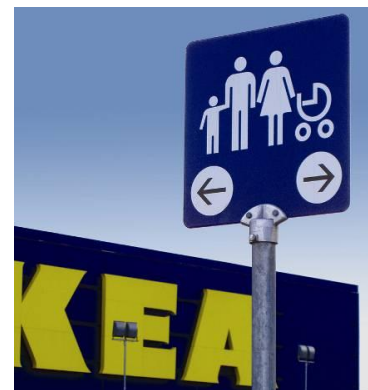
An observation photographed and brought to the seminar by Alves

Personal stories were added such as one student’s discouraging experience of attempting to raise gender issues when working for a children’s clothing company. An engaged discussion was ignited, not least by the ambition of the students to find strategies on how to reconcile their practice with their personal values and beliefs. Implications of how stereotypical design may restrict both expression, accessibility and function were probed and challenged the students to search for other ways of working through design to avoid the stereotypical and also to improve situations for neglected users. In relation to this, human behaviour was discussed at length and whether for example sitting positions or toilet habits of men and women, and the traditions behind different behaviour, are socially constructed or essential, and how to relate to this as a designer. This discussion also connected to related areas such as heteronormativity and ethnicity.