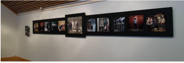
Presentation of Upptaget/Occupied at Blå Stället

However others demanded a solution and wondered why the design students had not made an object. As a contrast, some of the pupils, all boys, wondered if the students wanted to ban urinals.