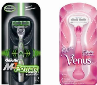
Razors, for men and for women – an example provided by students

The seminars were held every second week during a period of about two months in the fall of 2005. Each seminar, which lasted about three hours, had a theme which was defined as part of the process. For example, when the discussion seemed to steer in the direction of how gender is expressed in marketing, the theme for the next seminar would be Gender in Marketing, and an exercise would be to study commercial messages in shops and magazines and bring examples to discuss at that seminar. Such assignments also included to search for stereotypical objects, gender neutral objects, to observe presentations of objects in stores, to scrutinize media images etc. The samples brought back, for example in the shape of products, photos, clippings etc, and the observations made, were also presented and discussed in the seminars.