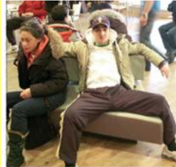
Pupils sitting in Duell/Duel at the exhibition

once you try to lean backwards. One common interpretation was that we have to work together to sit comfortably and to achieve equality – a tool for talking about equality through embodiment.