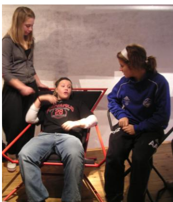
Girls sitting in Slashes 2006/Slothfully 2006 at the exhibition