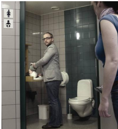
Example of staged photo from Upptaget/Occupied

However others demanded a solution and wondered why the design students had not made an object. As a contrast, some of the pupils, all boys, wondered if the students wanted to ban urinals.