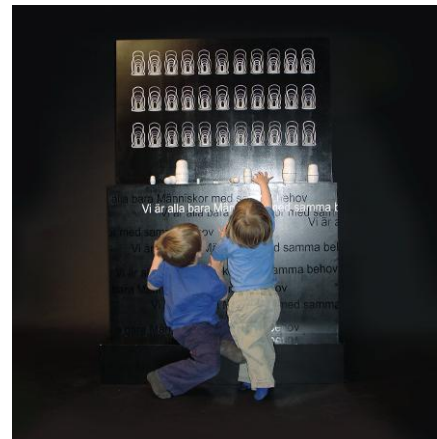
Bara människor/Only humans

anything, or, they are black and white, and that was what I strived for.”